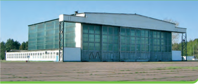
Hangar I 49 x 47 m/2,300 m 2 Höhe = 13 m